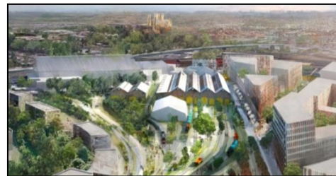
Construction & Infrastructure (including rail)