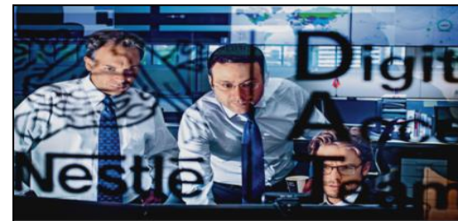
Digital, IT & Technology