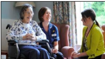
Health & Care

Harnessing the employment and career opportunities across all sectors for the benefit of all residents