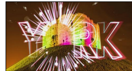
Hospitality & Tourism